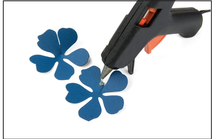
2. Apply glue to the tabs on the petal pieces.