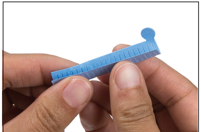
4. Fold the stamen in half.