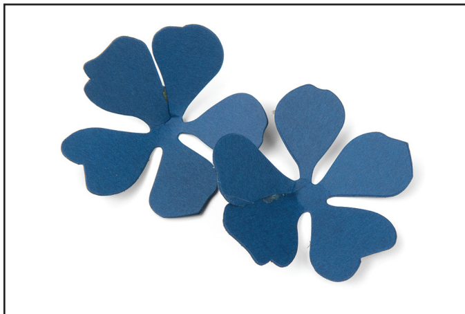
3. Adhere the adjacent petal to the glued tab. This will create contour to the petals.