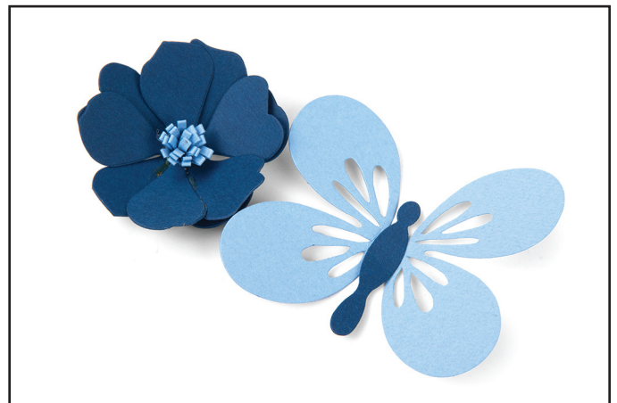
6. Embellish as desired.