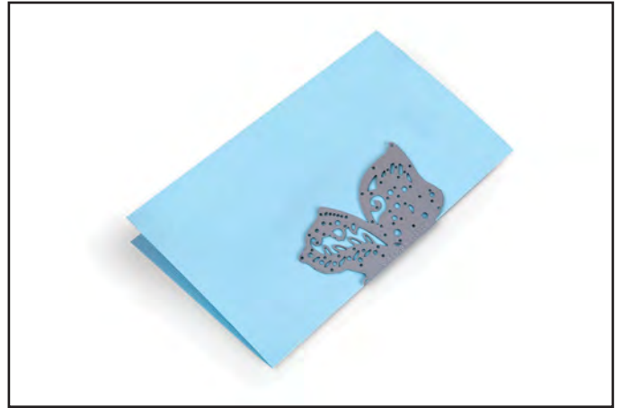
2. Fold cardstock, and place the die as shown. The die should be just a fraction past the folded edge. Run through a Sizzix® machine using the proper sandwich and platform setup.