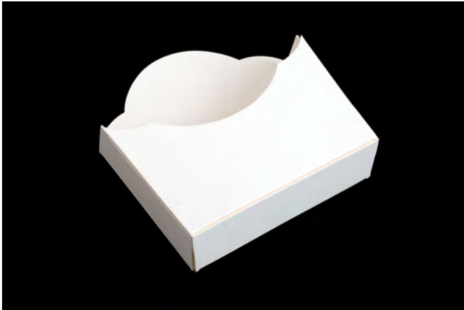
3. Adhere the side tabs to the Pocket front.