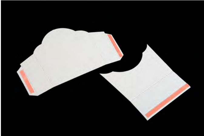
1. Die-cut mat board and apply adhesive as shown.