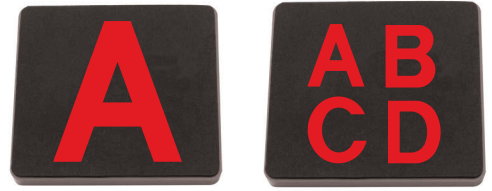
3 1/2" Single-Up